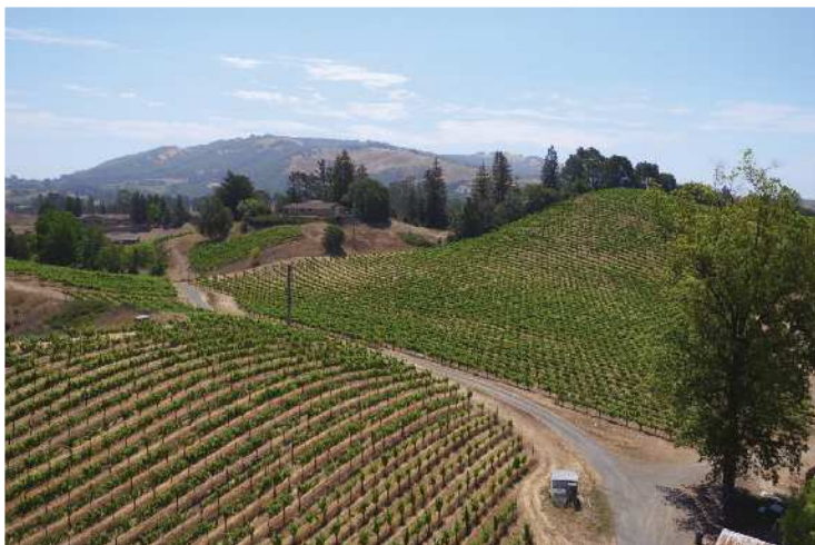
Sonoma Coast AVA Vineyard and Estate Winery $5,495,000