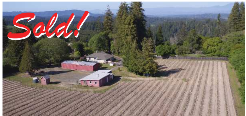
Green Valley / Russian River AVA Premium Pinot Noir & Chardonnay Vineyard Estate Asking $1,950,000

Wine country continues to be highly desirable, not only by those looking for a second or third home to enjoy an unmatched lifestyle but also by those that are interested in getting into the business. There are several approaches to the wine growing business. Some are looking to focus on farming and selling their grapes, taking advantage of favorable tax structures. Others are looking to take the plunge by starting from scratch: growing wine grapes, making wine, creating their own brand and ramping up sales. Then there are those that take the middle ground, a more practical