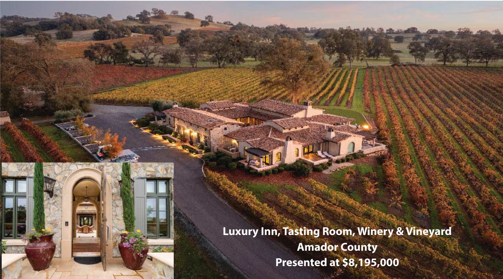
Luxury Inn, Tasting Room, Winery & Vineyard Amador County Presented at $8,195,000

The long and the short of it is that we are looking at another exciting year in wine country. If you are