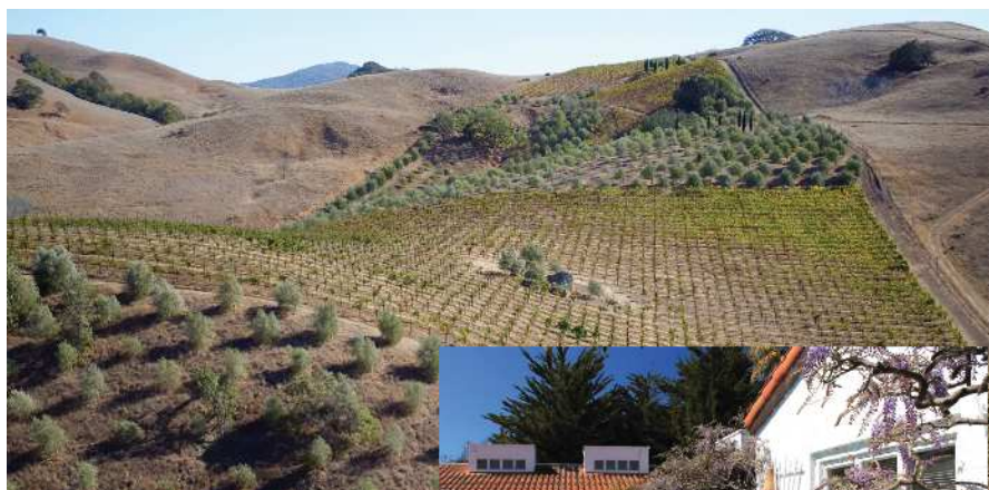
Petaluma Gap Vineyard Estate, Pinot Noir, Olive Orchard, Private $4,300,000