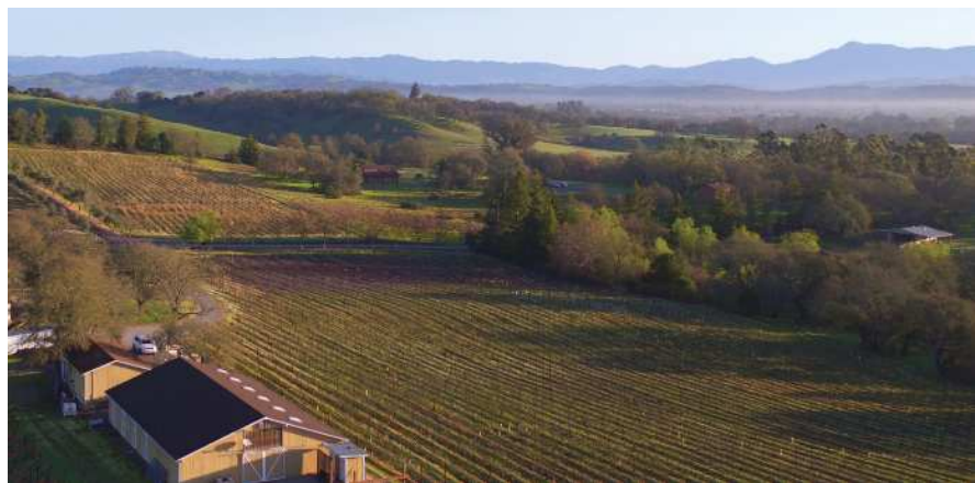
Healdsburg - Russian River Valley Premium Vineyard. Estate & Winery Potential $6,500,000