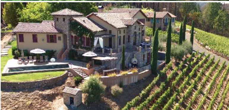
Diamond Mountain AVA - Napa Valley Luxury Estate & Super Premium Vineyard Asking $8,225,000

compared to San Francisco and Silicon Valley. The natural beauty of wine country and access to top tier creature comforts is an added bonus. The region continues to see a rebound in wine grape sales. An improved wine grape market helps support interest and viability in smaller vineyards for lifestyle buyers and larger vineyard acquisitions by industry players. This is positive news after the slim 2020 harvest, followed by the 2021 harvest that was diminished by drought. The silver lining - the 2021 vintage looks outstanding and wineries are realigning their strategies to lock in supply through contracts, purchasing quality land and vineyards to secure future stock. This is a "rising tide lifts all boats" kind of market.