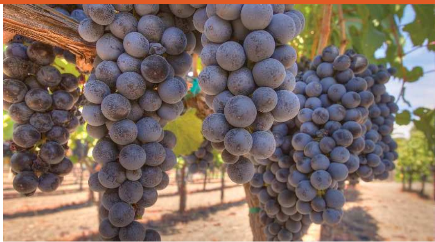
Napa Valley Vineyard Estate & Profitable Wine Brand $9,305,000